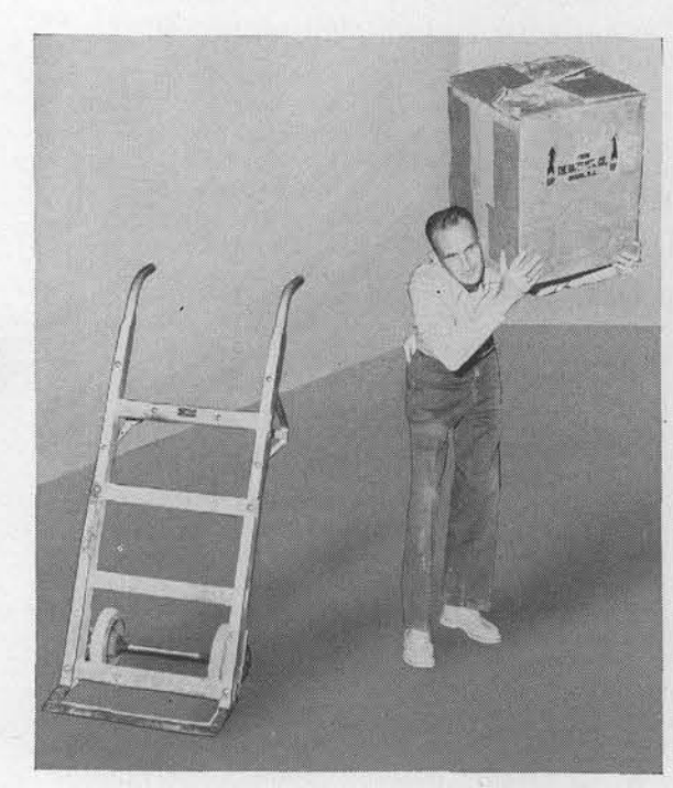
BACK INJURIES will become common to you if you try to be an Atlas instead of using a hand truck. Use the proper equipment whenever it is needed. Your injury may be permanent.